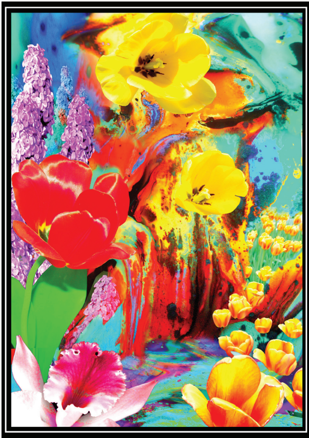
Wild Flowers - Lilac Ink and Enamel on Reverse Transparency 42" x 24"