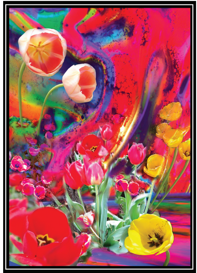
Wild Flowers - Tulip Ink and Enamel on Reverse Transparency 42" x 24"